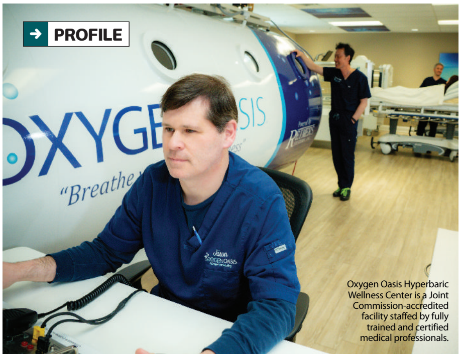
Oxygen Oasis Hyperbaric Wellness Center is a Joint Commission-accredited facility staffed by fully trained and certified medical professionals.

From professional athletes to accident survivors, people affected by concussion and other forms of traumatic brain injury heal with help from Oxygen Oasis Hyperbaric Wellness Center.