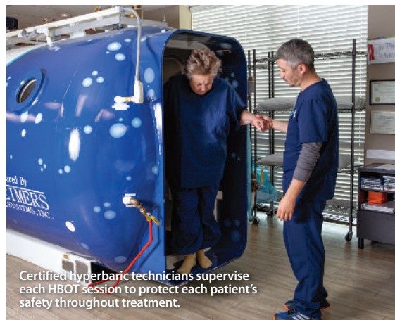
Certified hyperbaric technicians supervise each HBOT session to protect each patient's safety throughout treatment.